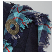
Plaids are available in a variety of tartans