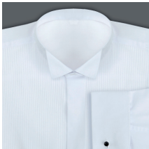
Dress Wing Collar* 14" - 21"