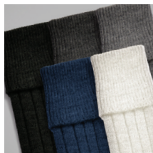
Black, Charcoal, Light Grey, Navy and Cream Hose