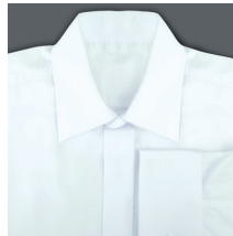
Standard Collar 9½" - 21"