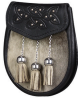
Semi Dress Sporrán