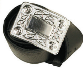
Belt & Buckle (also available with Dark Buckle)