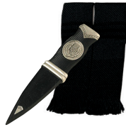
Flashes & Skean Dhu