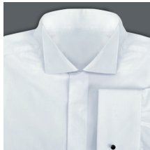
Victorian Collar 9½" - 21"