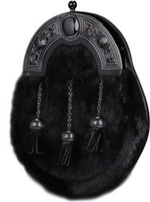
Dark Cattle Sporrán